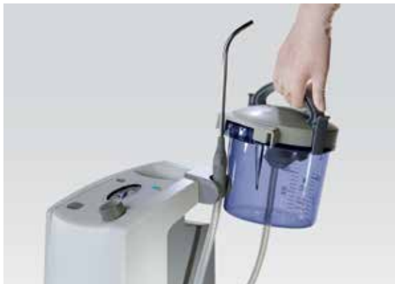
Removal of the secretion tank

During a surgical operation, the patient needs all the attention. Therefore the medical team needs to rely on powerful systems that work impeccably. Such is the infinitely variable VC 45 Surgical Suction Unit that meets surgical requirements with a suction volume of 45 l/min with a constant high vacuum of up to 910 mbar.