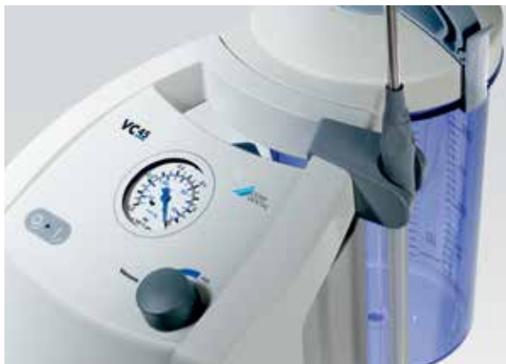
Maximum vacuum of up to 910 mbar