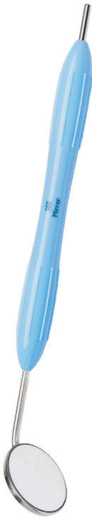
Mirror handle LM 25 XSI VET

Explorer probes are diagnostic combination instruments for detecting calculus, cavities and abnormalities on the tooth surface as well as measuring the pocket depths. Color coded markings on the probes indicate the depth/measure in millimeters of the periodontal pocket. Ball end does not harm gum tissue or damage pocket bottom.