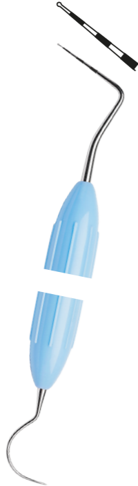
Explorer - Probe 2 LM 23-520B XSI VET