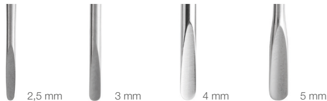
Luxating 2 LM 812220 VET

Luxating instruments are available in four different blade sizes.