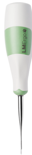
Root Luxating LM 812210 VET

Root luxating instrument is designed for delicate root teasing procedures.