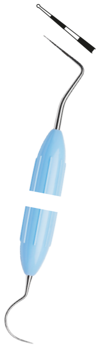
Explorer - Probe 3 LM 23-530B XSI VET