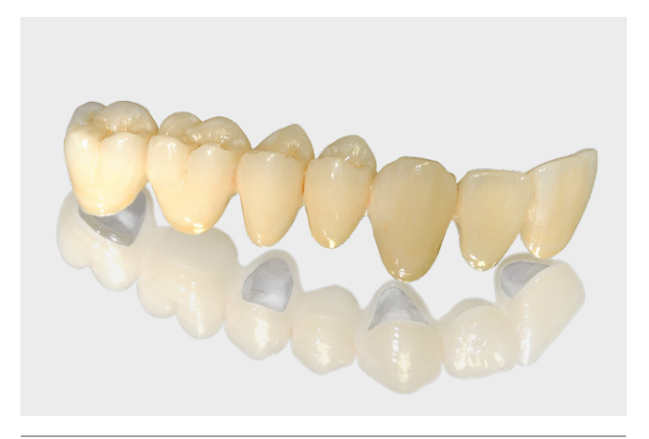
Outstanding bonding strenght with all leading ceramic materials