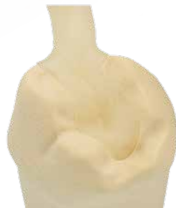
Optimal marginal seal

IPS PressVest Premium is distinguished by its high accuracy of fit. Everything fits precisely straight-away, without requiring time-consuming fitting procedures.