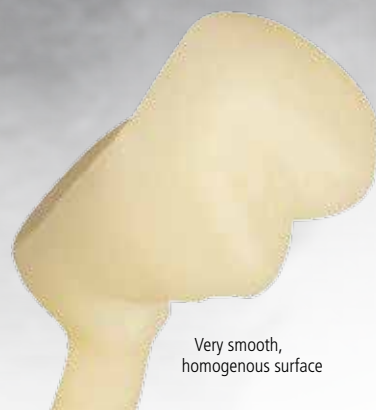
Very smooth, homogenous surface