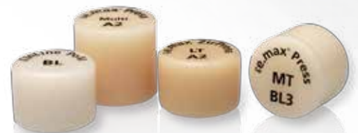
IPS e.max® Press, IPS e.max® ZirPress and IPS InLine® PoM

IPS PressVest Premium is used for investing Ivoclar Vivadent press ceramics. It is suitable for investing single-tooth restorations, bridges and hybrid abutments, and can also be used for the press-on technique with zirconium oxide and metal frameworks.