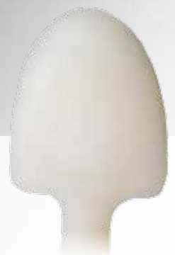
IPS PressVest Premium