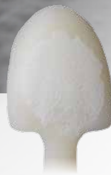
Conventional Press investment material

IPS PressVest Premium has only a slight reaction layer, which is very easy to remove. This makes divestment easier and saves time.