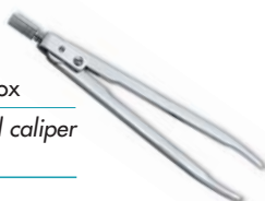
MB026-1 Compasso inox Stainless steel caliper

Perforated stainless steel impression trays without retention rim for complete denture.