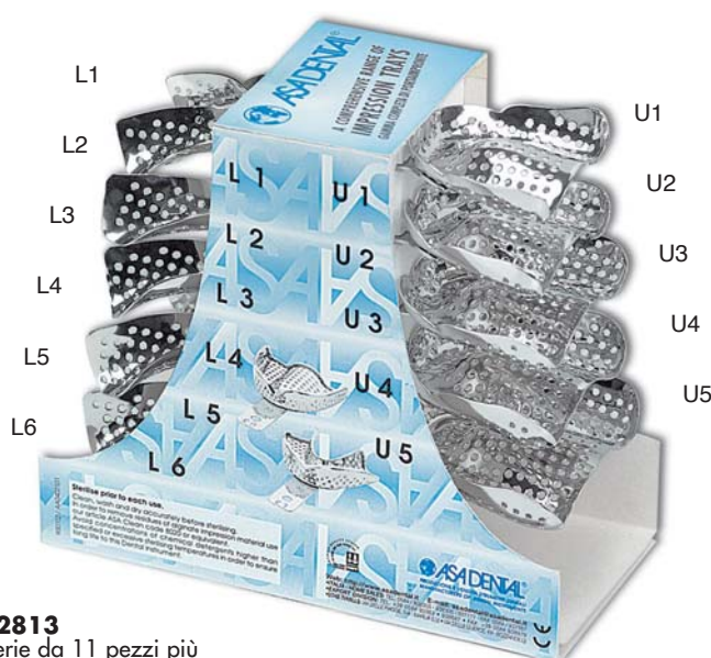
S2813 Serie da 11 pezzi più compasso per impronte definitive Set of 11 and caliper for final impressions